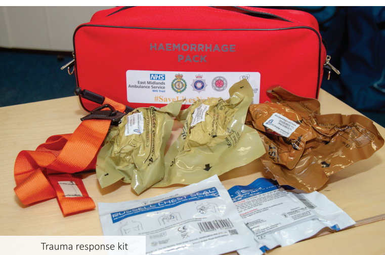
Trauma response kit

The specialist packs contain essential equipment needed to allow a response officer who is first on the scene of an incident to treat major injuries and administer potentially life-saving emergency first aid.