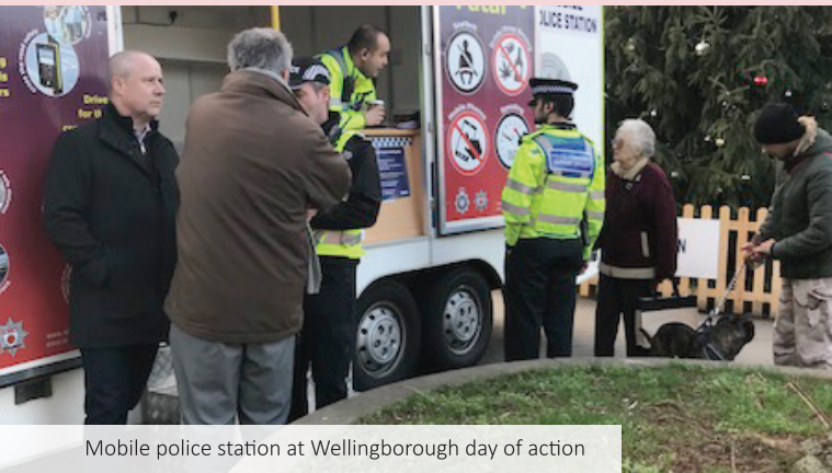
Mobile police station at Wellingborough day of action

The fund is up to £50,000 this year, and will pay out small grants to help officers and staff in their day job, solving problems and fighting crime and anti-social behaviour.