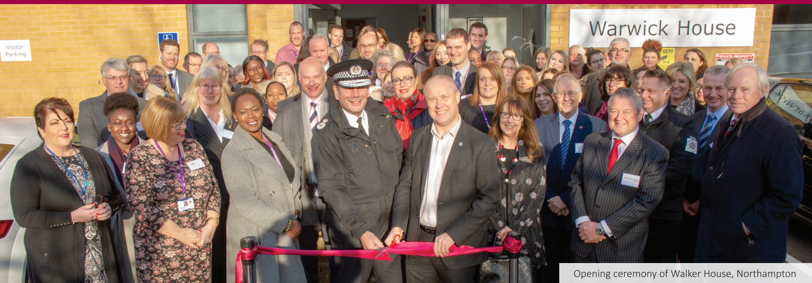
Opening ceremony of Walker House, Northampton